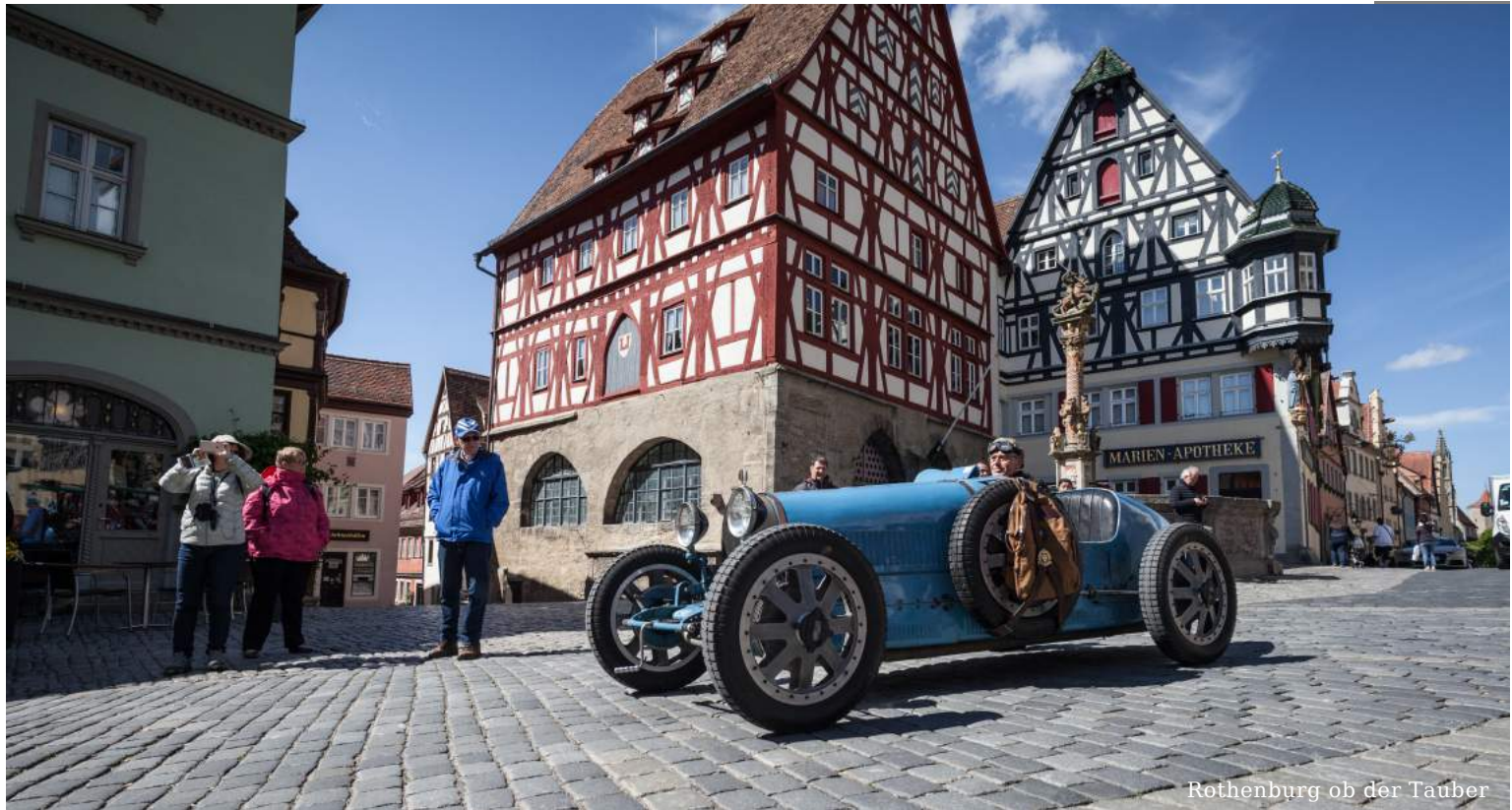
Rothenburg ob der Tauber