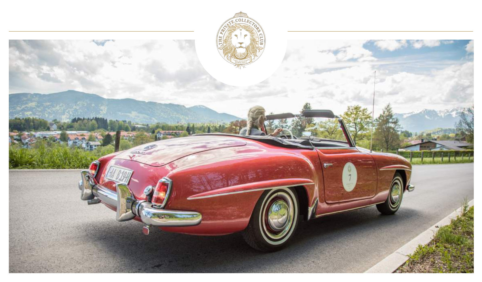
LADIES AND GENTLEMEN - WELCOME TO THE CLUB!

The Private Collectors Club takes you to a matchless car tour 1,000 miles/1.600 km from Hamburg across the Alps to Monte Carlo.